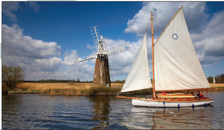
Right: A typical Broadland scene with a wooden sailing boat passing Turf Fen drainage mill.