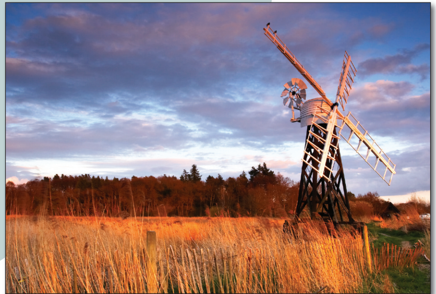
Late evening light illuminates the reeds beside Boardman's drainage mill.