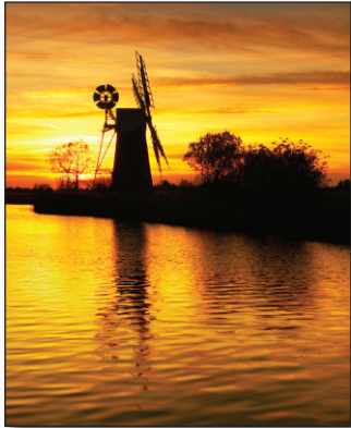
Turf Fen drainage mill at How Hill.