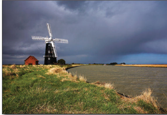
Berney Arms Mill sits alongside the River Yare and is the tallest mill on the Norfolk Broads.