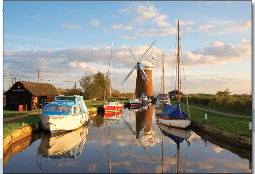
Horsey drainage mill reflecting in the calm still waters of Horsey Staithe on the Norfolk Broads.